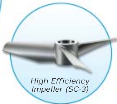
High Efficiency Impeller (SC-3)