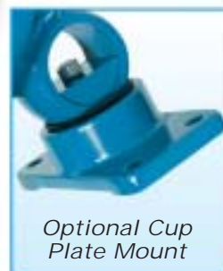
Optional Cup Plate Mount

Direct-Drive & Gear-Reduced Mixers Available