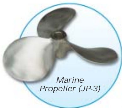
Marine Propeller (JP-3)