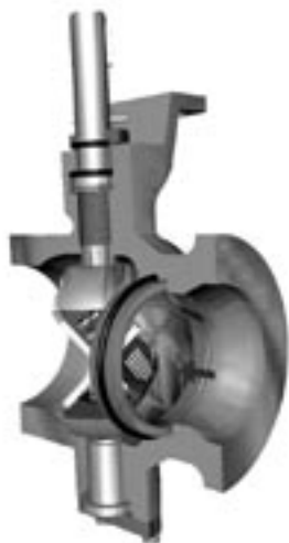
Fig. 2. The NAF-Trimsector with Z-trim in partial open position