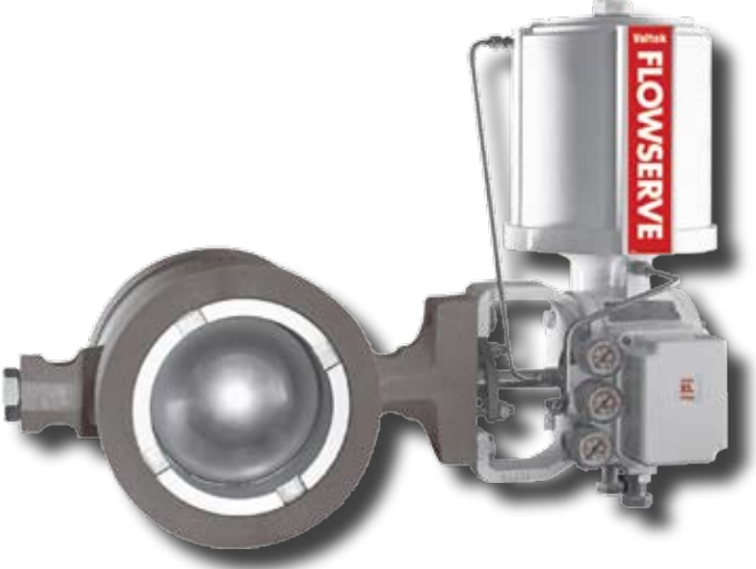
Valtek ShearStream HP